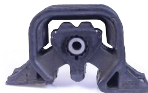
Figure 1 - profile of the engine mount that fits this bush