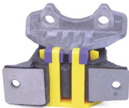
Figure 4 - showing how the two polyurethane parts will fit together inside the engine mount